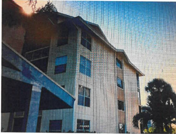
[Empty rectangular box]