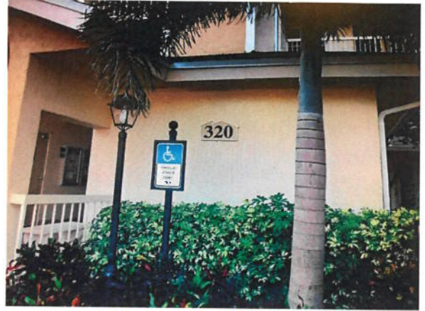
[Empty rectangular box]