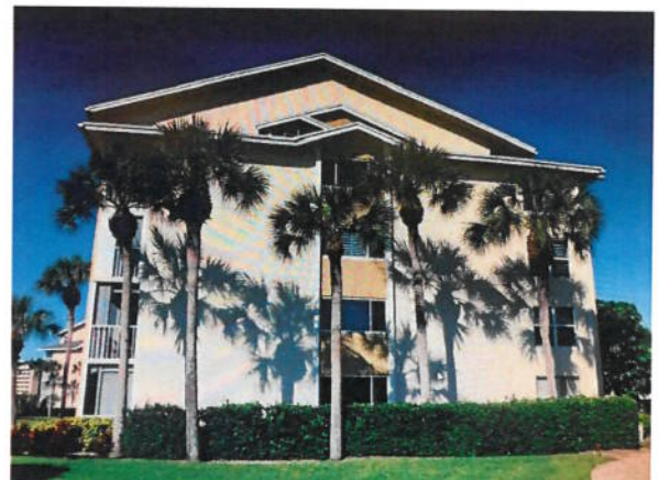
[Empty rectangular box]