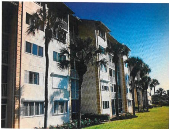
[Empty rectangular box]