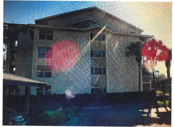
[Empty rectangular box]