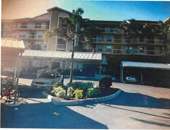
[Empty rectangular box]